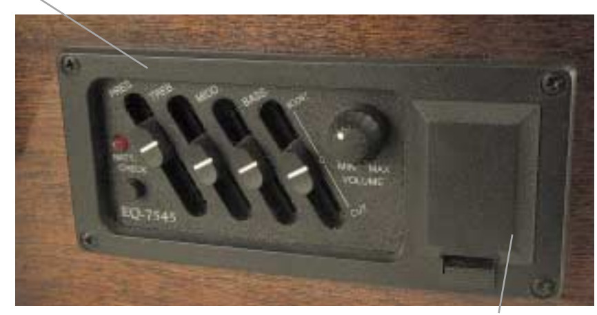
Easy Access to Battery

to my Strat, so I had to play it on the AF50CE. Even though I had to crank it a bit to ride over the band I got plenty of volume yet still didn't encounter any feedback problems.